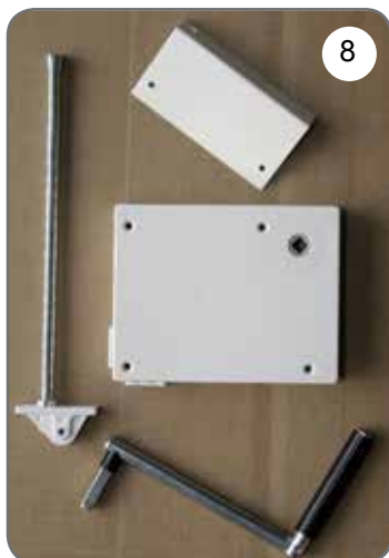
Winch for rope, angle for winch, rope guide, handle [8].