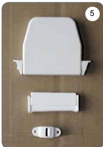
Outside strap box coiler, tabular strap guide, strap grip [5].

b) Types of applied, manual drives (options):