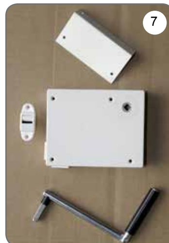
Winch for strap, angle for winch, strap guide, handle [7].