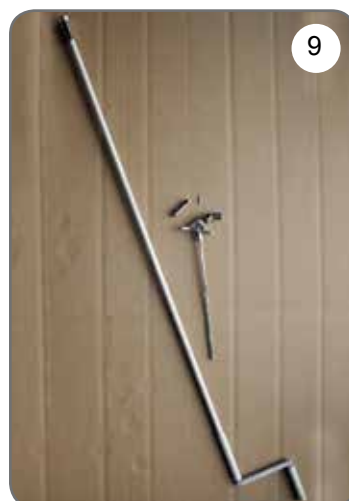
Handle, Cardan joint 45° or 90° with hook [9].