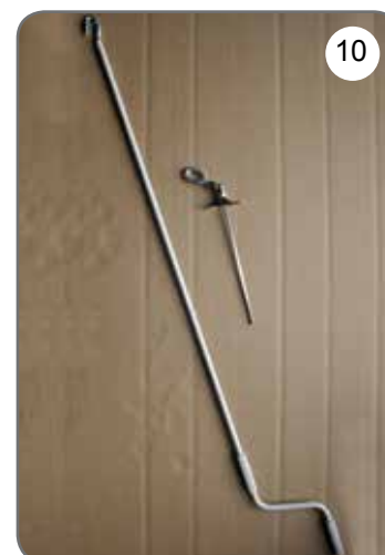
Handle, Cardan joint 45° or 90° with eye [10].