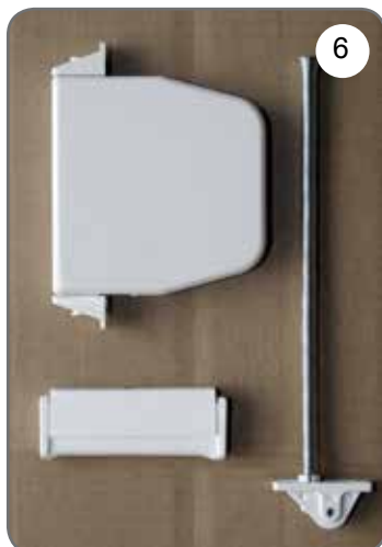
Outside rope box coiler, rope guide, rope grip [6].